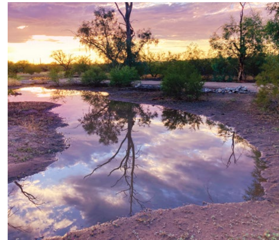
Stormwater is captured from neighborhood streets, reducing flooding of the streets, and soaking in water across the broad floodplain supporting Velvet Mesquite and Palo Verde trees.