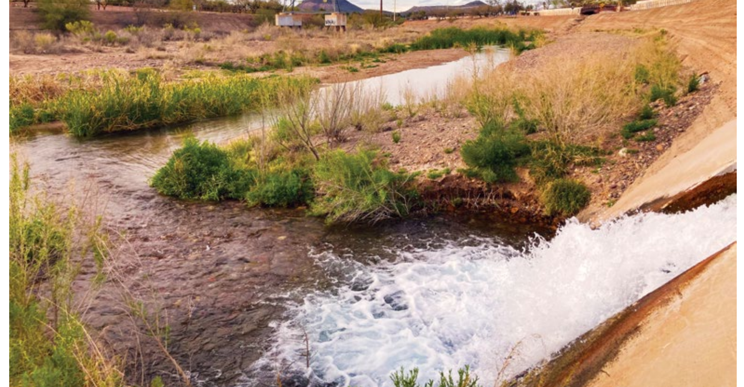
Groundwater treated for PFAS is released into the Santa Cruz River near Irvington road.