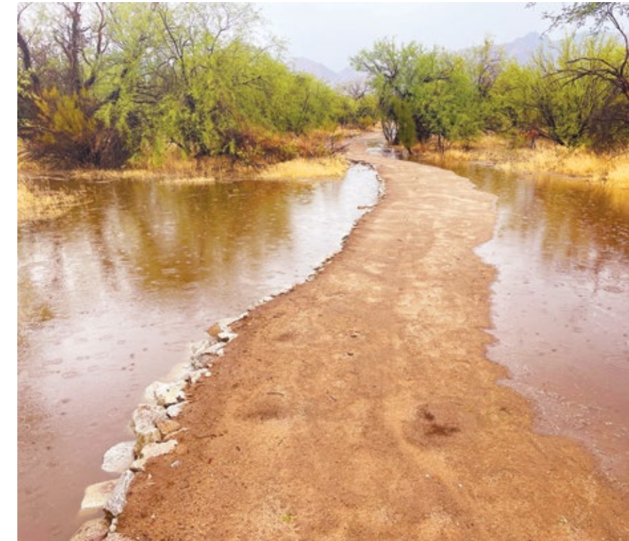
Restoration efforts included creating raised earthen trails to shed water into nearby basins. In addition, rogue trails were closed to reduce wildlife habitat fragmentation.