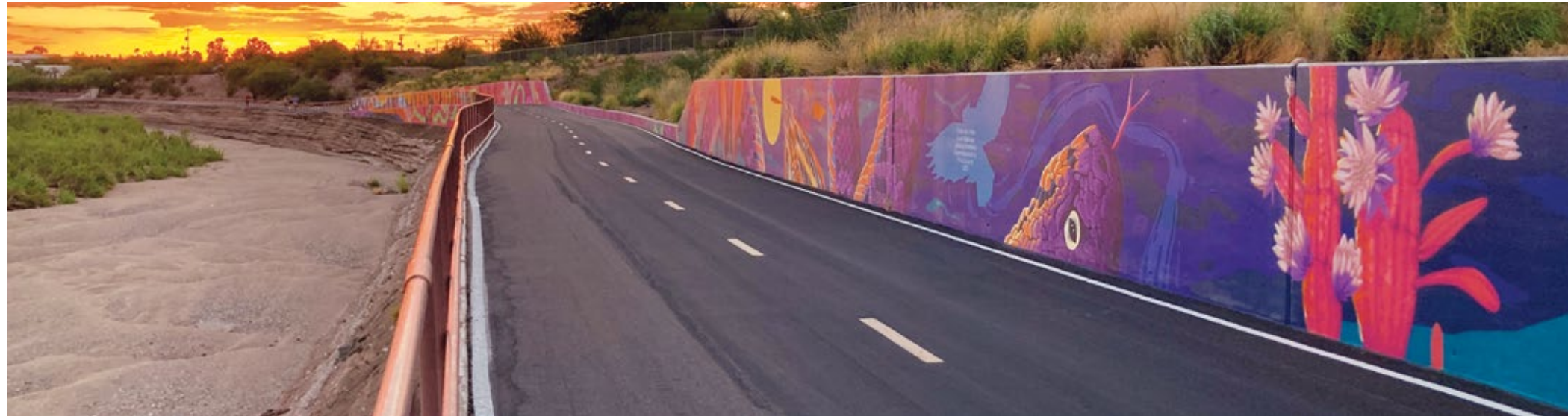
A new mural brightens the bike path along the Rillito River, close to the floodplain that makes up the Rio Vista Natural Resource Park.