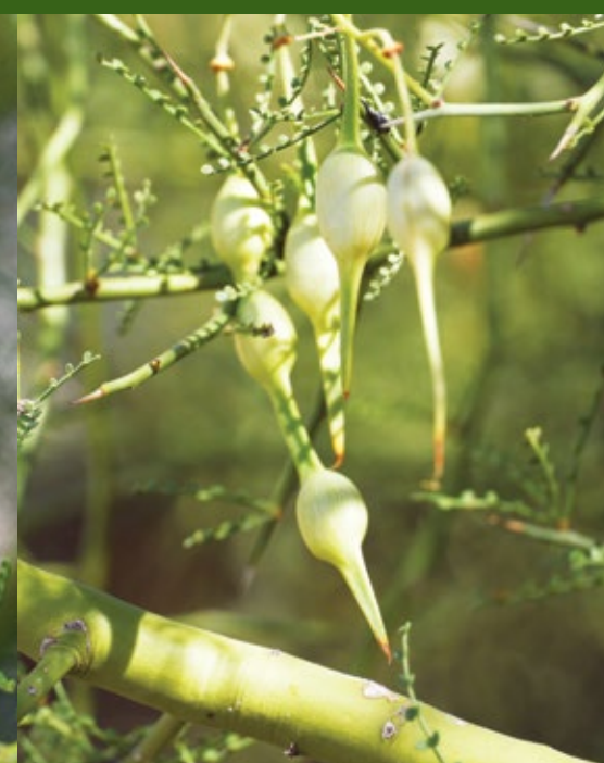
Foothills palo verde